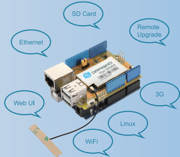
Arduino Yun Compatible Board